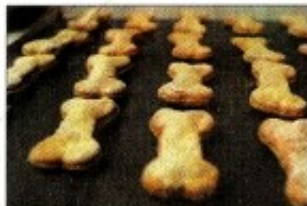
To learn more, log on to www.kovalosky.com or www.dogtreatrecipes.org .

She has had much better luck with the bones, however, as the felines tend to be finicky.